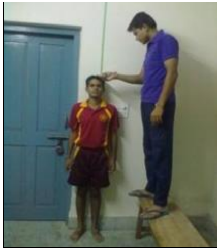
Fig 1: Standing height

Purpose: To measure the standing height of the subject Equipment: Wall, tape Procedure: The height of the subjects was measured with subject standing erect without shoes, adjacent to the wall. The subjects were instructed to keep the heels together, body touching the wall with heels, buttocks and back, head erect without lift and to take a and hold a full breath and standing erect while height measurement taken. Scoring: Height was recorded correct to the nearest half of a centimeter.