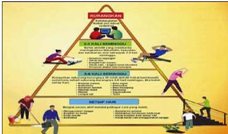
Fig 1: Piramid Fizikal Aktiviti

To get the most benefit, you should begin by warming up for 5 to 10 minutes to increase your blood flow and prepare your body for activity. Follow the warm up with several minutes of stretches to increase your flexibility and lower your risk for injury. Complete your selected exercise or activity for 20 to 30 minutes and conclude the workout with 5 to 10 minutes of cool down and stretching.