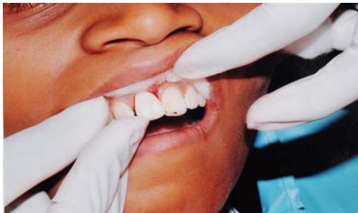
Fig 5: Positioning of Replanted tooth