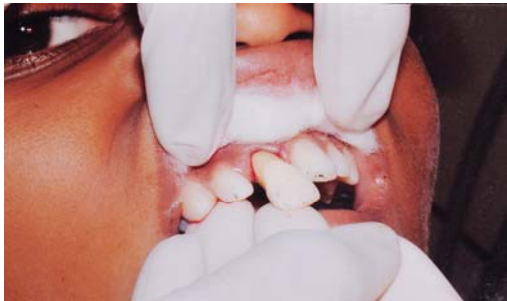
Fig 4: Replantation of tooth