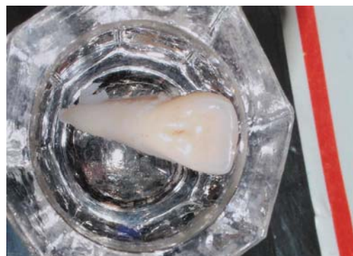
Fig 2: Avulsed tooth