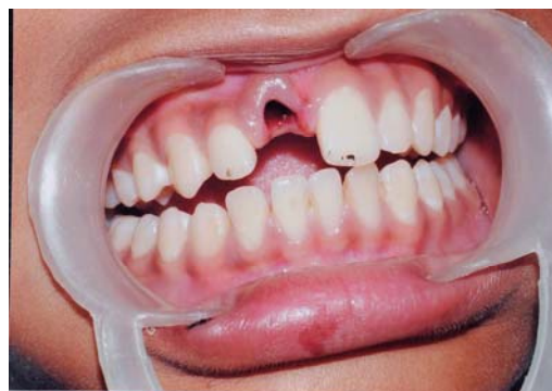
Fig 1: preoperative photo