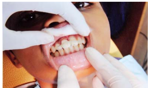
Fig: Splinting with orthodontic wire.