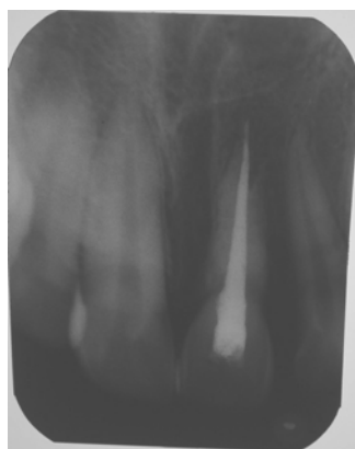
Fig: Post – Operative Radiograph after 9 yrs.