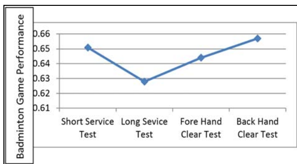
Fig 1: showed graphical representations of co-efficient correlation between selected Coordinative ability parameters with Badminton Game Performance.

Graphical representations of Table-1 have been showed in Fig. no 1.