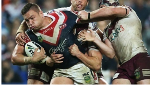
Fig 1: Aggression is sometimes natural for the game

Aggressive and violent actions which might be illegal outside sport, or in supposedly non-contact sports like Basketball, Football, Cricket, etc. are legal and allowed in the context of combat sports like Judo, Karate and Wrestling, or team contact sports like Rugby, American football and Ice hockey. All these sports are characterised by high levels of aggression and often violent physical contact which may be within the rules of the game and not intended to injure. The same sort of behaviour outside the sports context may however be defined as criminal. Participants in these sports have also accepted the inevitability of rough contact and possible injury in these sports.