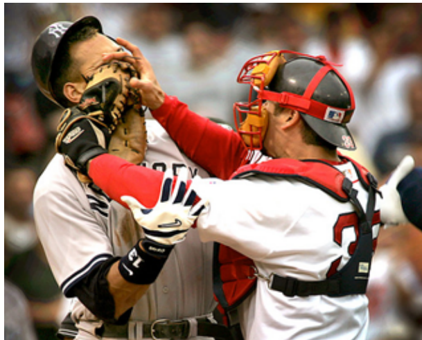
Fig 2: Aggression is sometimes unwarranted

A high degree of aggression that is not in line with competitive spirit is illegitimate and sometimes even illegal. In some sports, however, there appears to be a gray zone where aggression is accepted by 'victims' as a legitimate part of the game.